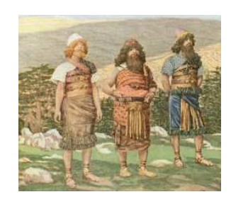
Simplified Shem in Middle East, Japheth North, Ham South

Eastern region. But actually it is more complex, because some descendents of Ham and Japheth stay in the Middle East or go into Asia, and there is also a lot of mixing in the following years. Still today, many of the names of the nations in Genesis 10 can be identified with modern nations, cities, and people groups, but that does not necessarily mean these people are descendents of the people of the similar name in Genesis 10, because often nation and city names remain the same after wars and people movements have changed the makeup of the population.